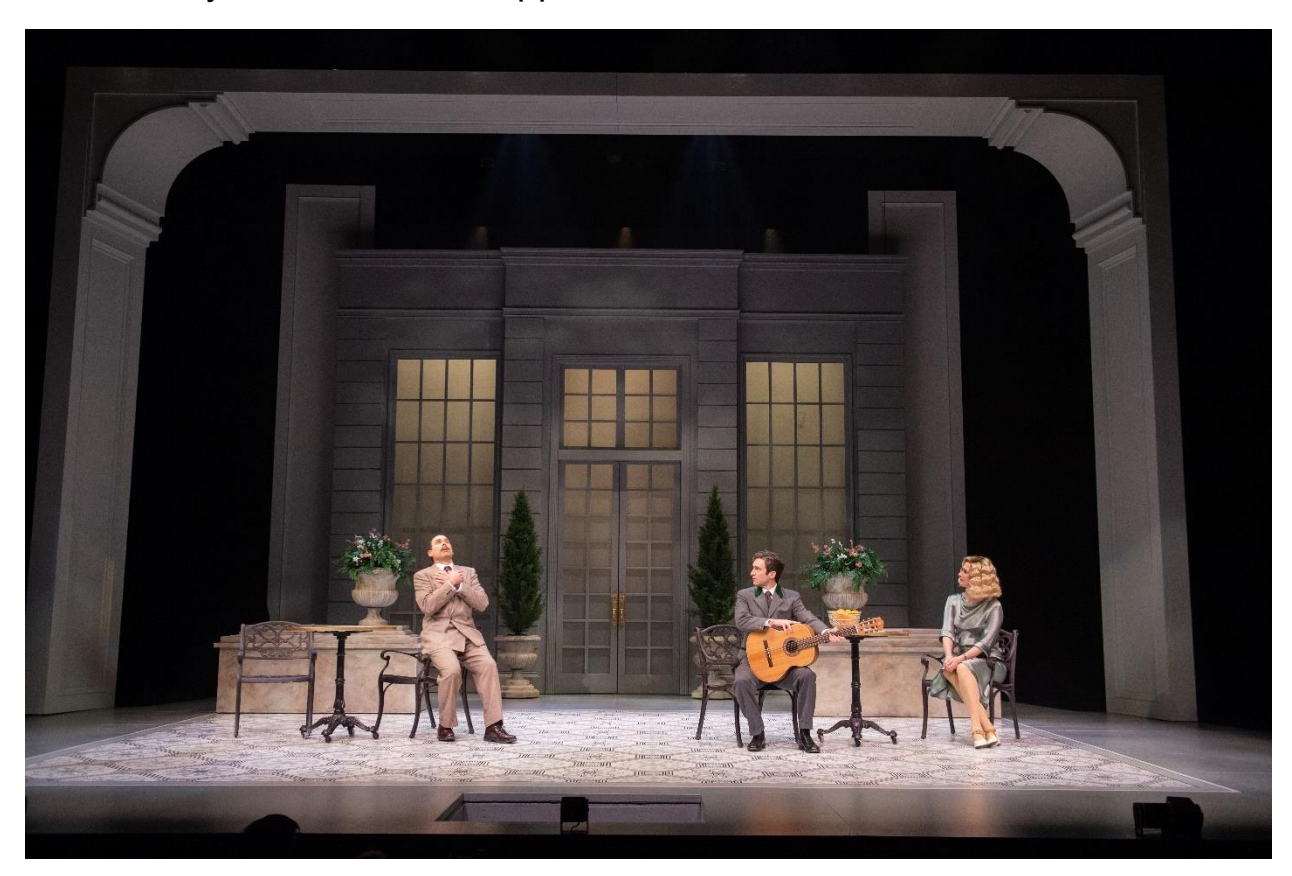
This is the stage at the music festival.